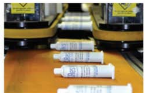
Extensive Labeling Capabilities