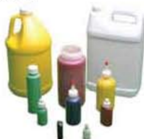
Plastic bottles from 7cc to a gallon.