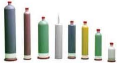
Disposable plastic cartridges for precision dispensing available in 2.5, 6, 8, 12, 1/10th gal, 20, 32oz