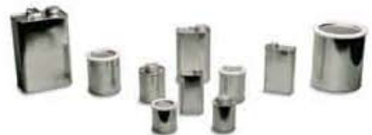
Metal cans round and rectangular some with brush caps 4oz to gallon.