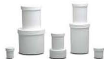
Plastic jars with lids from 1/2 to 32oz.