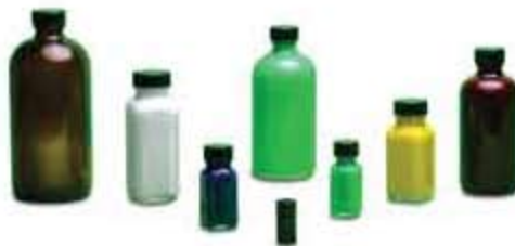
Glass bottles square and round in sizes from 4ml to 32oz and many with brush caps available.