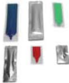
Flexible pouches made with clear and foil film in sizes from 2ml to 28ml.