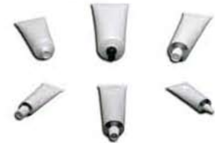
Aluminum tubes 1, 3, and 5.4oz also grease tubes 3 & 14oz (not pictured)