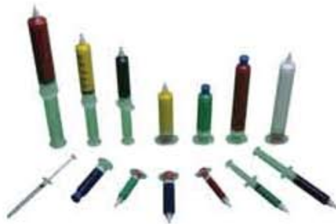
Air & manual syringes from Fisnar, Techcon, EFD Nordson, Fishman and B & D in sizes from 1cc to 60cc

Kitpackers stocks and packages a great variety of one component packages for precision dispensing.